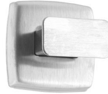
AI0033CS Satin finish