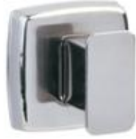
AI0033C Bright finish